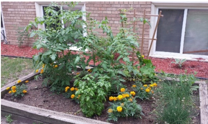
Jackson Square's consumer garden, so lovely and functional. Jackson Square residents planted, have kept up on weeding, and will soon be able to cook with some of their garden goods.