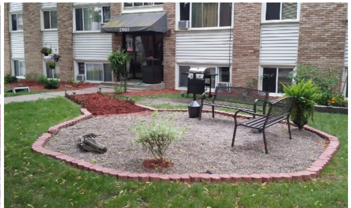
Jackson Square's new patio.

Thanks for letting us brag about some of the fun and exciting things that Pinnacle Service's consumers are up to. These are just some of the reasons why we do what we do here at Pinnacle Services.