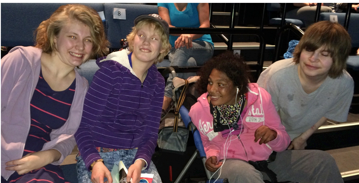
Hillcrest ladies having a great time at the Cat in the Hat in May.