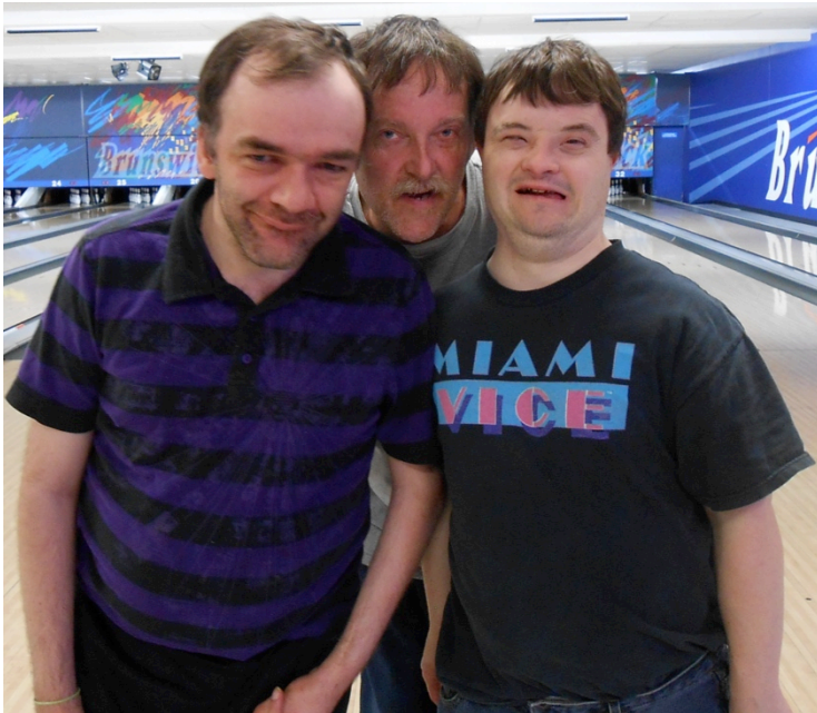
Bavaria Lake housemates celebrating TK's birthday at a bowling alley.